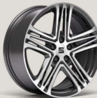
PERFORMANCE 18" 30/8 NUCLEAR GREY MACHINED ALLOY WHEELS' FR