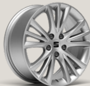
DYNAMIC 17" 30/3 BRILLIANT SILVER ALLOY WHEELS St