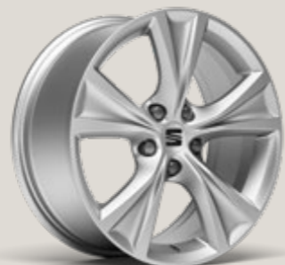
DYNAMIC 17" BRILLIANT SILVER ALLOY WHEELS FR