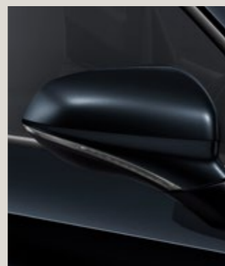
FIORD BLUE 1 St FR