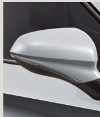
GLACIAL WHITE 2 St FR