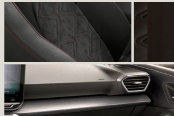
DINAMICA® SPORT SEATS