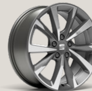
PERFORMANCE 18" 30/6 COSMO GREY MACHINED ALLOY WHEELS' FR