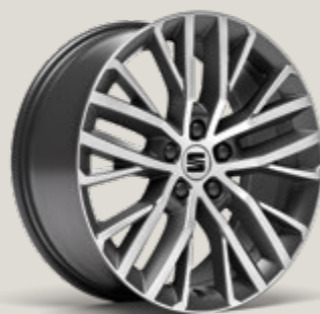
PERFORMANCE 18" 30/4 NUCLEAR GREY MACHINED ALLOY WHEELS' FR