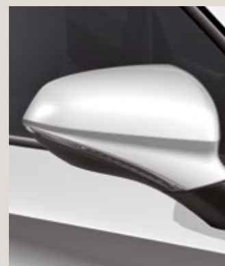
CANDY WHITE 1 St FR