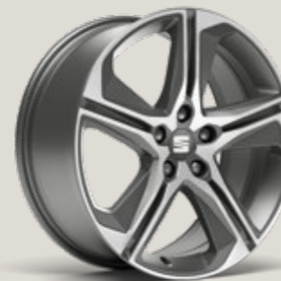
PERFORMANCE 18" 30/9 COSMO GREY MACHINED ALLOY WHEELS' FR