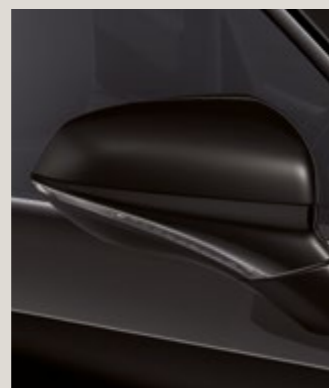
MIDNIGHT BLACK 2 St FR