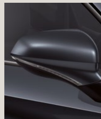
MAGNETIC TECH 2 St FR