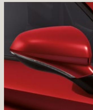
DESIRE RED 3 FR