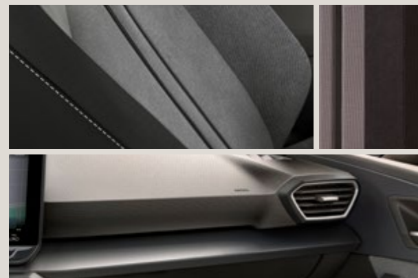
CLOTH COMFORT SEATS