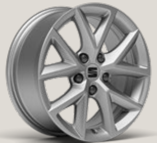
DESIGN 16" 30/2 BRILLIANT SILVER ALLOY WHEELS St